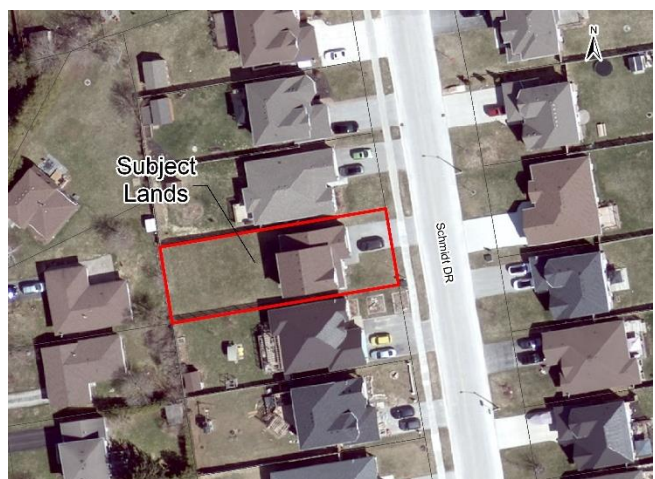
Figure 1. 2020 Aerial photo of subject lands

The purpose of this application is to provide relief from the minimum width for a private garage. The applicants are proposing to add an additional residential unit in the basement. As a result, an additional permanent parking space is required. The applicant is proposing to make